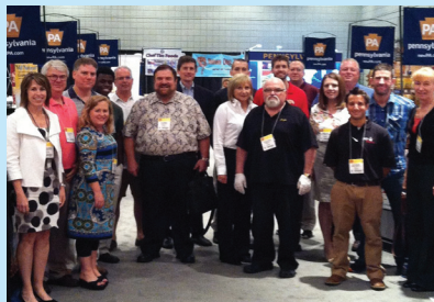
PA Pavilion at the Summer Fancy Food Show in New York City