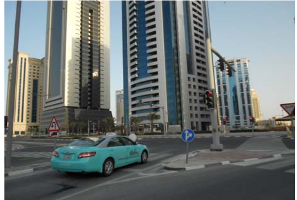
Intelligent Transportation System architecture and design, Qatar